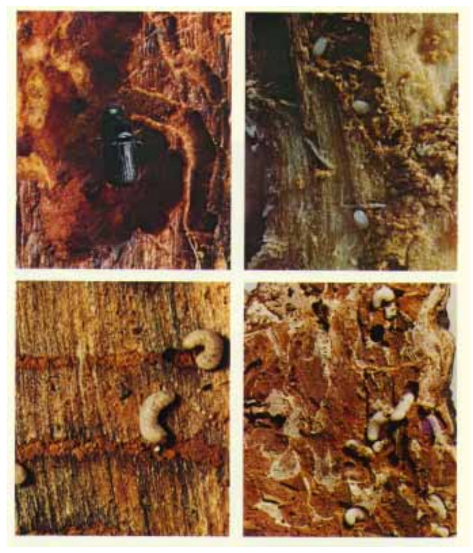
F--700132 F--700133 F--700134 F--700135

Figure 4.—Stages in development of roundheaded pine beetle: top left, adult; top right, eggs; bottom left, larvae; bottom right, larvae and pupae in outer bark.